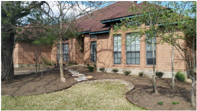
New homes built on older, large plats blend in with historic homesteads

With increasing traffic in College Station and Bryan, the College Woodlands Neighborhood