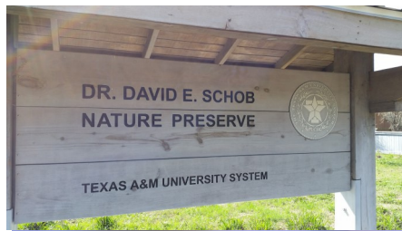
The Schob Nature Preserve on Ashburn Ave., pictured on the cover, is one of two green spaces within the neighborhood boundaries. The other is Woodland Parkway Park.

The College Woodlands Neighborhood is nestled in the center of the historic Eastgate Neighborhood, sometimes called College Hills, only 5 minutes from the entrance to Texas A&M, and stretches from Lincoln Avenue to Dominik Drive and Walton Drive to Munson Avenue. Platted in the 1940s, it is among the oldest of College Station's neighborhoods, and is characterized by large wooded lots, quiet streets, a park, a nature preserve, a variety of home styles, and longtime homeowners who care deeply about neighborhood preservation and maintaining a sense of community.