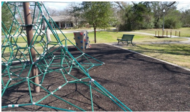
Woodland Parkway Park playground

The school playground is one of three nearby playgrounds. The other two are located in Woodland Parkway Park and nearby Thomas Park, which also has tennis and basketball courts, a swimming pool, running track, and multiuse field.